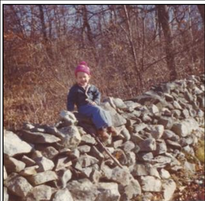
Here you see my two-year-old son sitting on the stone wall in our back yard in Massachusetts. The wall in this case became a fence. All children had to help maintain the wall and build it in the beginning. If children were not able to build the wall, they were expected to help carry smaller rocks to the wall location.

Younger children would help stack the wood in a location close to where it was used (just outside the back door, for example). They dragged saplings, brush, and small branches to a burning pile for disposal. The ash was then collected in barrels, taken to town and sold, or used to make soap.