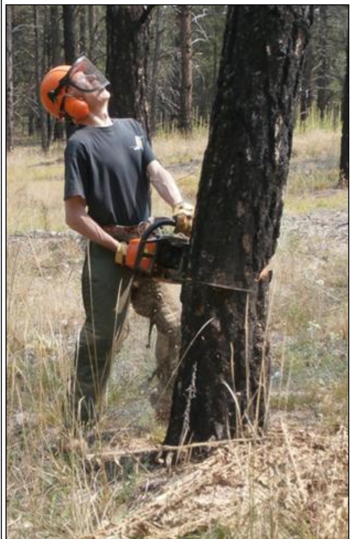
Today we have modern tools, such as chainsaws and wood splitters that we can use to help cut down trees and split wood more easily for home fireplaces or wood stoves. Note the protection Mr. Seelye is wearing: hard hat with ear and eye protection, chaps, gloves, and heavy boots.