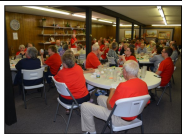
Dinner on Monday, July 27, was at Abilene's Hitching Post Restaurant and was the premiere of the reunion theme song.