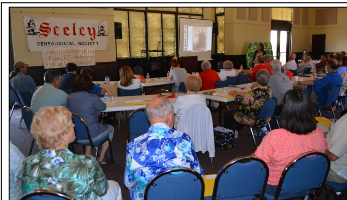
The 2015 SGS International Reunion was held in Abilene, Kan. July 27-29, 2015. It was the society's 16th reunion and marked its 50th anniversary. Members from across the country attended.