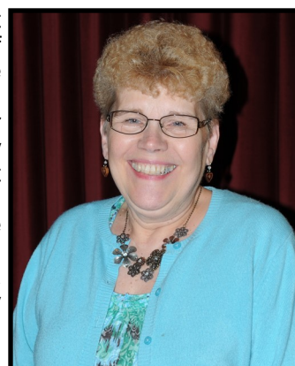
Please See Queries Page 8

Queries are assigned a query number by the Query Editor, researched and then sent to the Query Team and