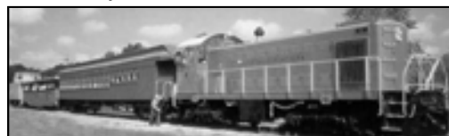
Abilene & Smoky Valley Railroad