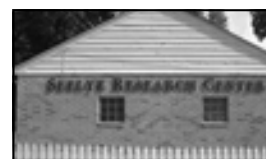
Seelye Research Center