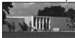
Eisenhower Presidential Library & Museum