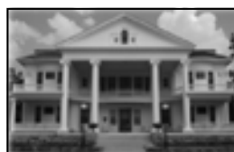
Historic Seelye Mansion

The reunion will feature the informative sessions you've come to expect, plus a chance to visit with family, as well as experience Abilene, Kansas and the remarkable history of the Great Plains!