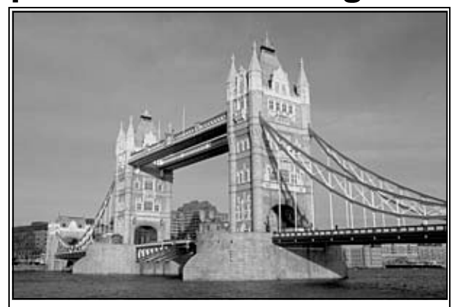
The Tower Bridge in London is just one of the many sights SGS members will have the opportunity to see first hand during the SGS tour of Robert Seeley's England.