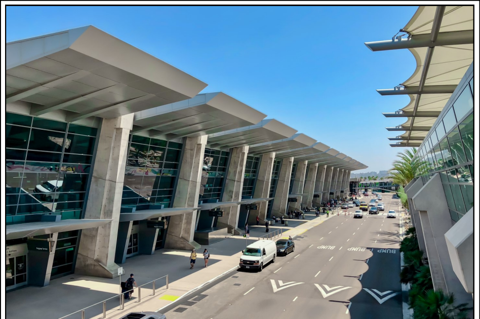
A short five miles away from the Cosmopolitan hotel, San Diego International Airport may be the best choice for those flying in for the reunion.