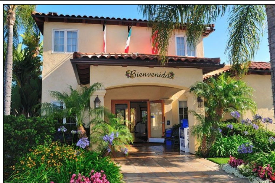
Located just a half mile away from the Cosmopolitan, the Old Town Inn offers a convenient location and a special rate for SGS Reunion attendees.

Please See Accommodations & Airports Page 9