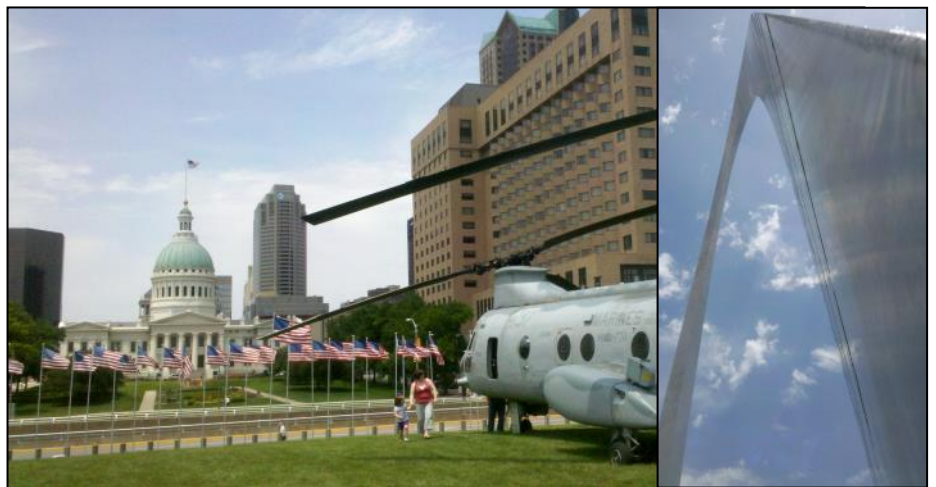
The Old Courthouse of St. Louis County (left), the Gateway Arch (right) and NARA's National Personnel Records Center are among the many tourist attractions and research facilities SGS Reunion attendees will have at their disposal during the 2021 conference.

The membership then voted to hold the 2021 SGS Reunion in St. Louis, Missouri. Stamford, Connecticut was also proposed. I officially adjourned our 2019 SGS General Membership Meeting by