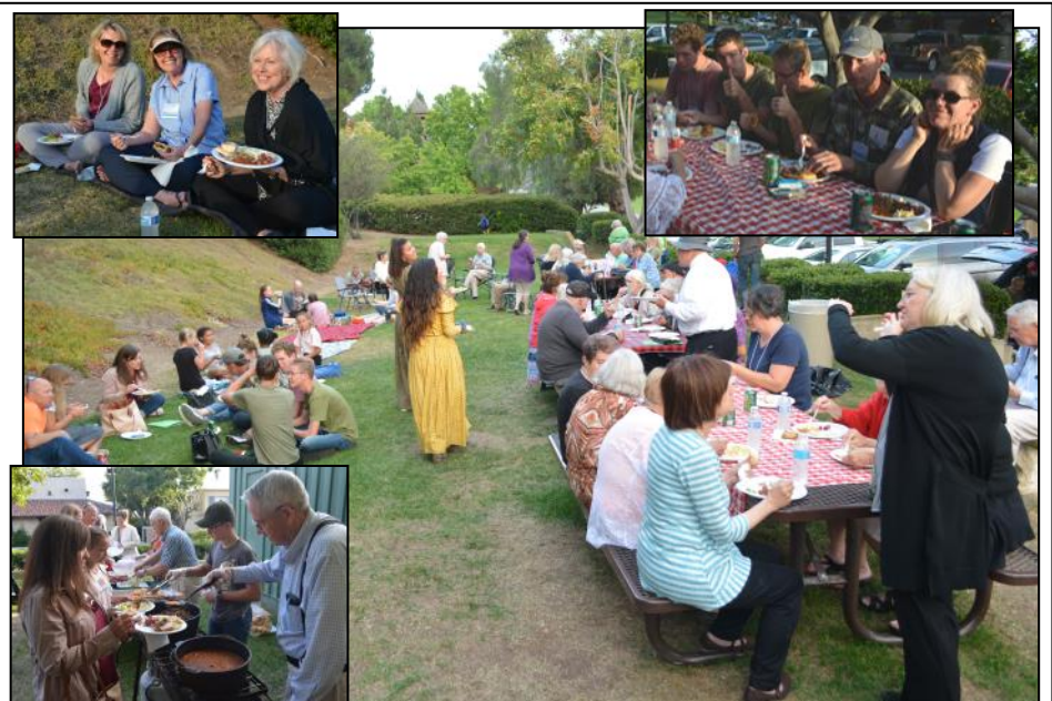
Reunion attendees enjoyed a cookout prepared by the Petersen family at Old Town San Diego's Mormon Battalion.