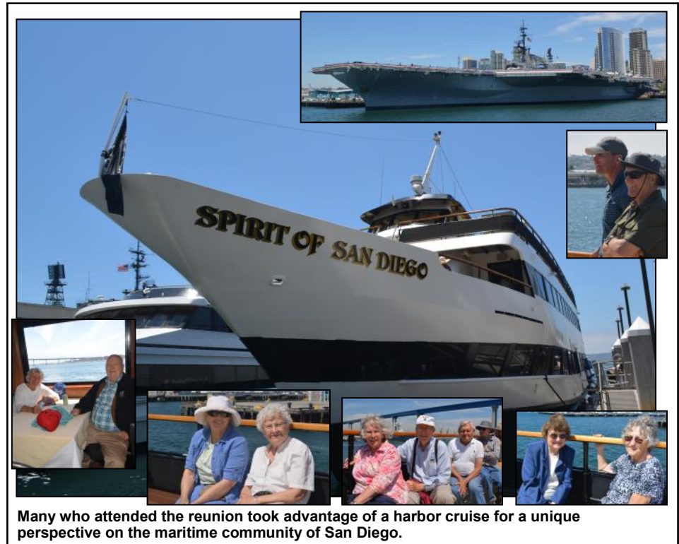
Many who attended the reunion took advantage of a harbor cruise for a unique perspective on the maritime community of San Diego.

at the hotel because they had been asking for the new signs for a long time and received permission to create them when they knew the Seeleys were meeting at the Cosmopolitan Hotel. We were so sorry that the Cosmopolitan sign could not have been put up on Thursday when we were at Old Town all day. Some members did see the sign go up, but most of us had to see it when we returned from our harbor cruise.