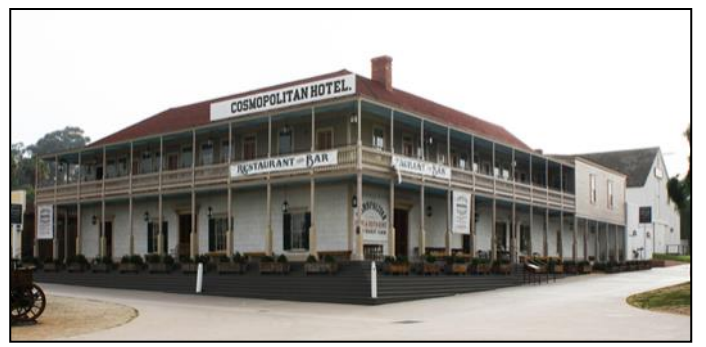
The Cosmopolitan Hotel in Old Town San Diego is the site of the 2019 Seeley Genealogical Society's International Reunion. On the right side of photo, behind the hotel, you can see historic Seeley Stables.

makeover from 1947 to 1950 to look like a Spanish colonial hacienda. California State Parks acquired the building along with numerous others in 1968 and made the hotel the centerpiece of <u>Old Town San Diego</u> <u>State Historical Park</u>. The hotel underwent an extensive restoration in 2007. The Cosmopolitan only has ten