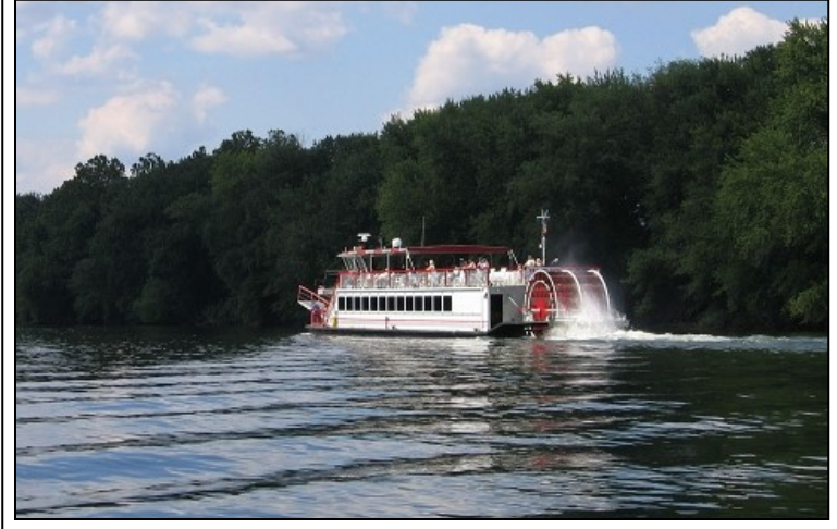
The 2017 SGS Reunion will feature a dinner cruise aboard the Valley Gem Sternwheeler .

Indian tools, jewelry, weapons, and household items (ca. 9000 B.C.) to oil paintings, vintage clothing, guns, military paraphernalia, furniture belonging to West Virginia's first governor, automobiles of the early 1900s, farm implements, nineteenthcentury jewelry, and glassware