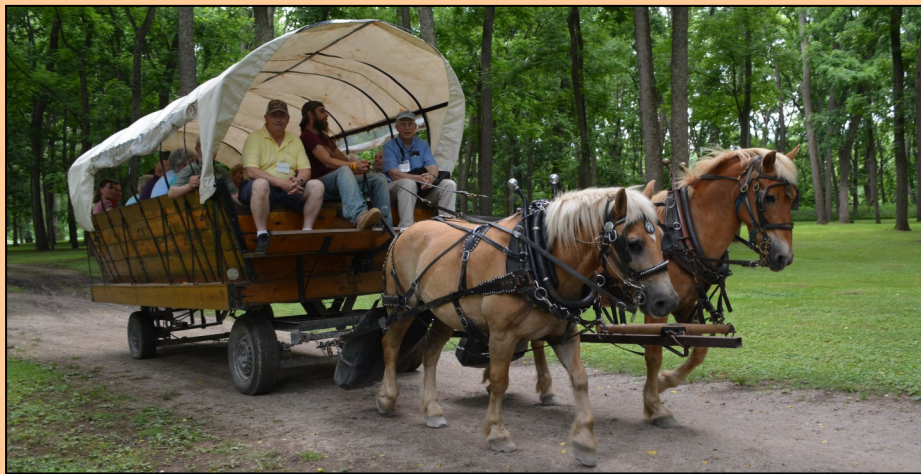
During a visit to Blennerhasset Island some reunion attendees got in touch with their pioneer roots during a tour of the island.

from Terry Tietjens at the Seelye Research Center.