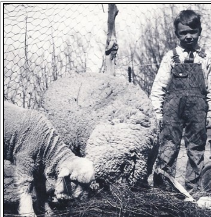
People still raise sheep today. Here you see my mother's cousin, about 5 years old, with 2 sheep:

What did children do in the 1600s? If their family had sheep, they would help care for the sheep and herd them, either to pastures or the town square where sheep were allowed to graze on the grass. Then they would lead the sheep home at night and care for them in a shed near their houses. Above, you see sheep in the field with the cattle.