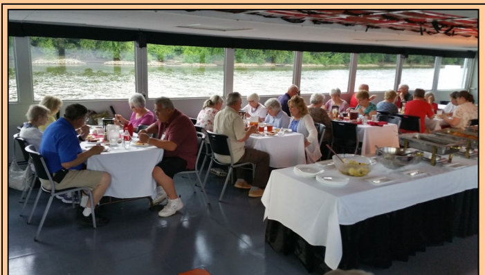
Reunion attendees enjoyed dinner and a cruise on the Ohio River aboard the Valley Gem Sternwheeler