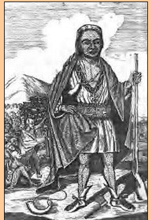
A Portrait of King Philip, by Paul Revere, from the 1772 edition of Benjamin Church's The Entertaining History of King Philip's War .

Though comparatively massive, the fort was eventually overrun after a fierce fight. The fort was burned, its