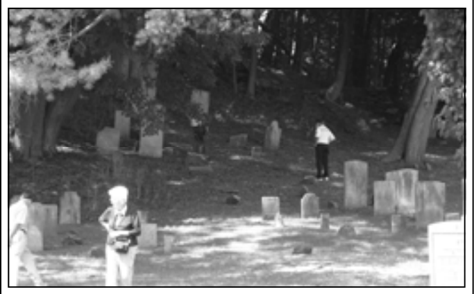
During a visit to "the quintessential New England town" of Bedford, N.Y. the group spent some time wandering through the old cemetery next to the town green looking for Seeleys.

After another lovely continental breakfast on the morning of Wednesday, Sept. 19, we boarded the trusty bus again, this time heading through Rhode Island toward Mystic, Conn. Mystic was a major seaport on the mouth of the Mystic River. The European settlement there was named after the native name for the area, Mistack. While Robert was living at Watertown (1634 - 1637), he was recruited to join the militia in their defense of the settlements receiving attacks from the Pequot Indians. The white settlers allied themselves Narragansetts and the Mohicans and journeyed to the Mystic area where the Pequots had forts and were preparing an attack. In this Peguot war of 1637, a band of soldiers and Indian warriors under the command of Captain John Mason (to whom Robert Seeley was second-in-command) attacked the Pequot fort at Mystic and burned it to the ground. Hundreds of Pequots perished in the attack, later to be known as the Massacre at Mystic. Our tour group gained insight into the causes of the Pequot war and its far-reaching effects by watching a documentary on the Massacre at Mystic while riding our